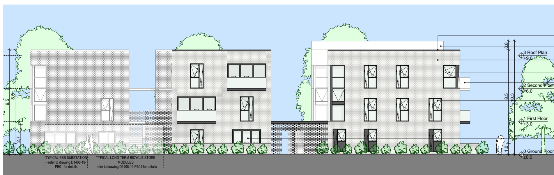
West Elevation 1:200