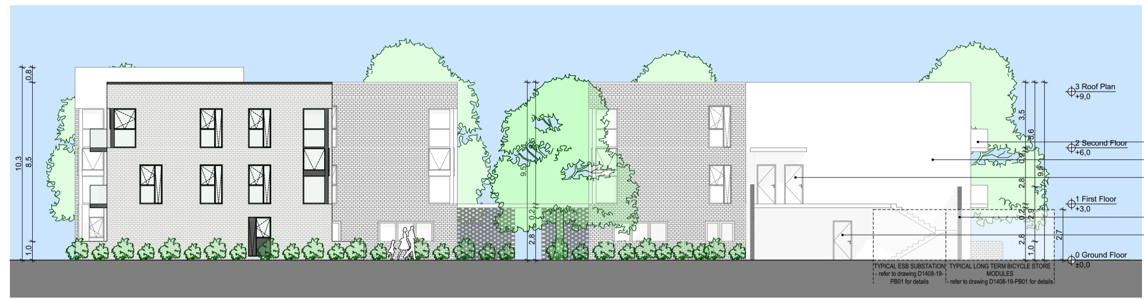
North Elevation 1:200