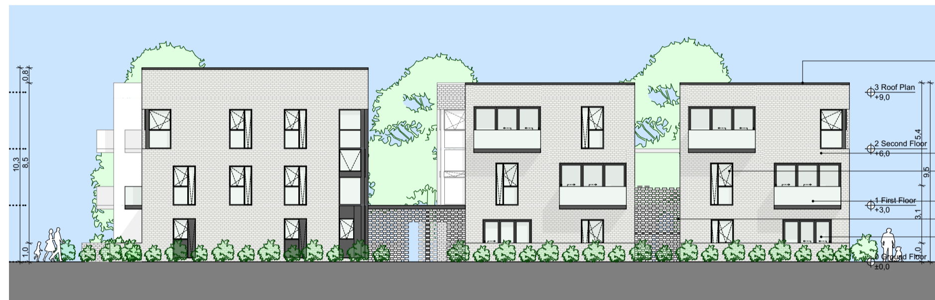
East Elevation 1:200