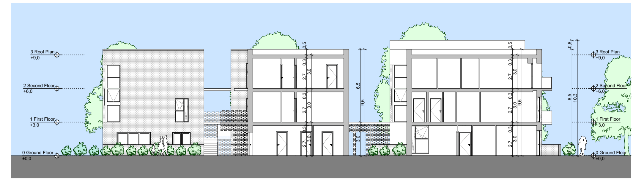
Section 1 - 1 1:200