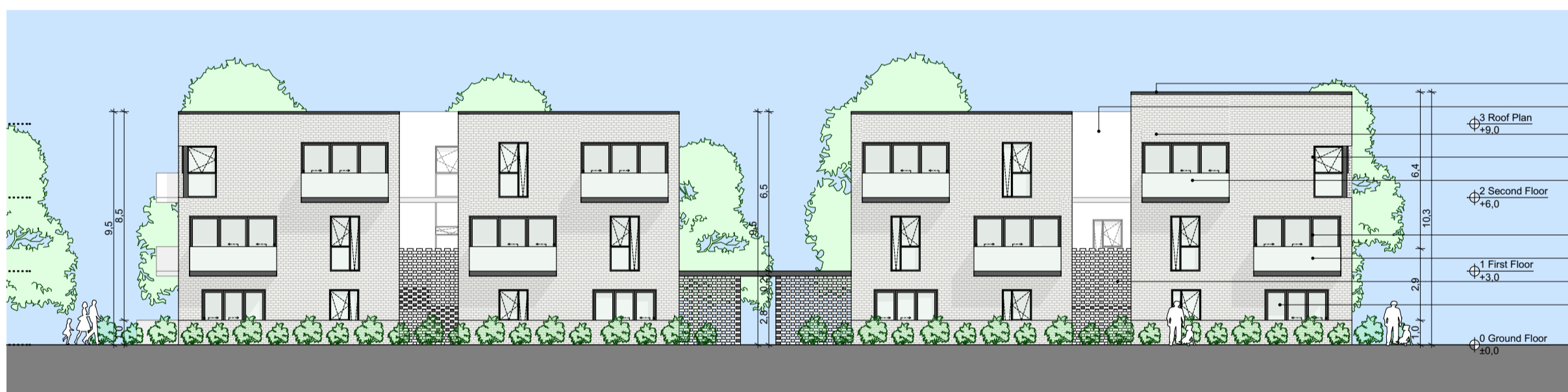
South Elevation 1:200